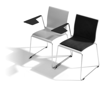
Sting Writing Tablet | O30 (Foldable and removable).